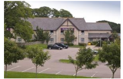
Premier Inn hotel at the Mains of Balquharn