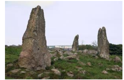
Old Boutreebush Stone Circle

Findon was famous for its Finnan haddie (also known as Finnan haddock, Finnan, Finny haddock or Findrum speldings) which is a cold-smoked haddock, smoked using green wood and peat. Its origin is the subject of a debate and the "dispute" goes back to the eighteenth century, although it is hard to trace.