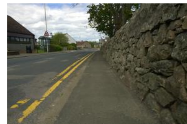
Narrow Path by Leathan

It is believed that the older residents and those with young children used a circular route. Following the Place Standard engagement there had been contact with Stagecoach regarding