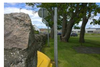
The other side of the wall