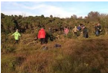
Portlethen Moss Conservation Group at work