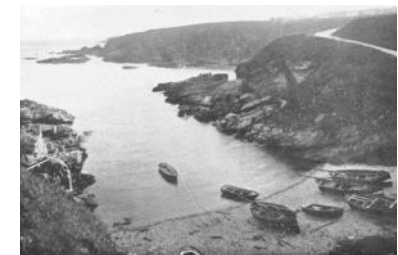
Portlethen Harbour 1920's