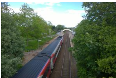
Portlethen Railway Station