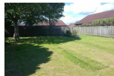
Little used play area

There are a number of actions that can be taken forward from these themes. The timescale will vary: some may be short-term; some may take up to 3 years to bring to fruition. However, support from the people of Portlethen and the area will be vital. The community will need to play its part in making these points work for the people and taking them forward in ways that perhaps cannot currently be foreseen.