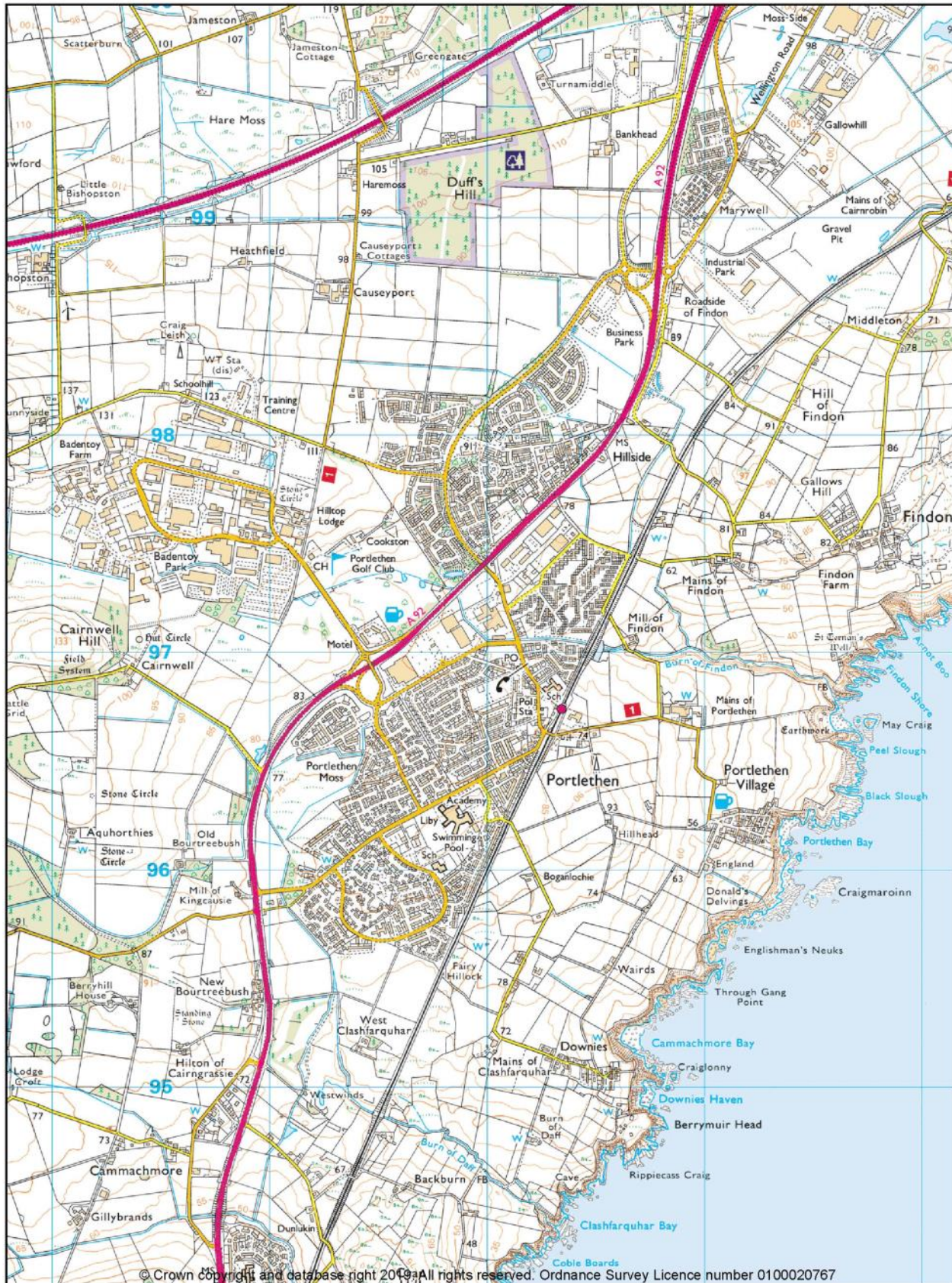
Portlethen (with Findon & Downies)