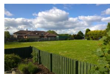
Land beside Cornerstone