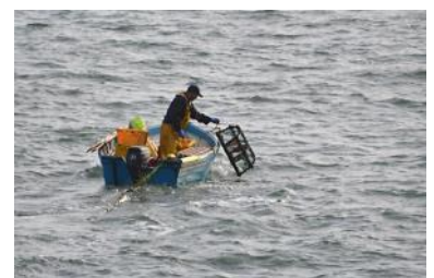
Creel Fishing off Portlethen