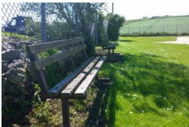
Bench at Old Porty