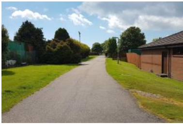
Big Path by Paddock

The main issues and aspirations raised by the community have been grouped into five themes summarised below with proposed actions outlined in the table at the end of this plan. These reflect the situation that was current as the action plan was developed, but will be supplemented by further actions as these are identified over time. Community action planning is a dynamic and progressive process that will reflect the priorities of the various subgroups within the community as they evolve. It is also dependent on the involvement and energy of the community to enable action to be achieved.