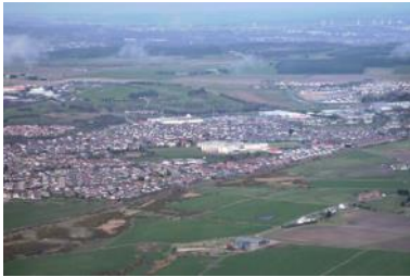
Portlethen from the air 2008