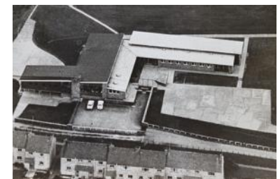
Portlethen Primary 1962