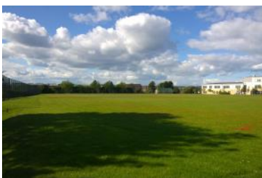
Pitch without Floodlights

In preparing this Community Action Plan we are mindful of actions being undertaken as a result of community engagement events using the 'Place Standard Tool' led by Aberdeenshire Council and Architect & Design Scotland. It is not the intention that the actions in this plan duplicate or contradict the outcomes and subsequent activities from this participation; it is hoped that the activities held within this document will dovetail with actions and activities already identified through this process. A brief summary of the feedback from these events is included in this Community Action Plan as many of the points are reflected across all the engagement undertaken.