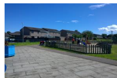
Nicol Park Play Area