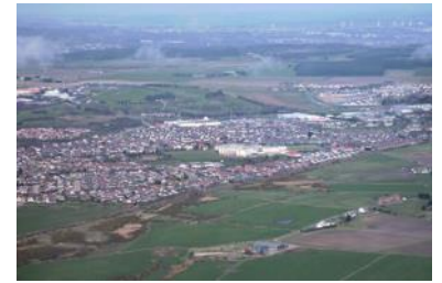
Portlethen from the air 2008

Kincardineshire Development Partnership is one of a number of rural partnerships in Aberdeenshire who run the Community Action Plan initiatives sponsored by Aberdeenshire Community Planning Partnership.