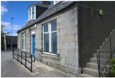
Portlethen Police Station