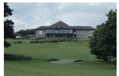
Portlethen Golf Club