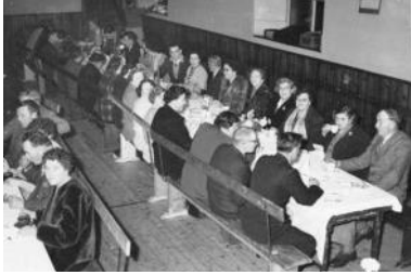
Jubilee Hall Burns Night Supper 1960