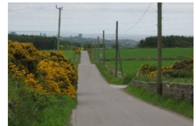
Part of the Causey Mounth Road, a modern section