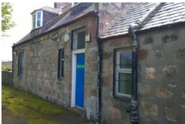
Portlethen Police Station rear